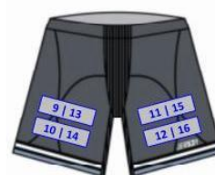
Voorzijde (9, 10, 11, en 12) en achterzijde (13, 14, 15 en 16) Dutch Flyers overbroek

Above are some examples of positioning on the apparel items.